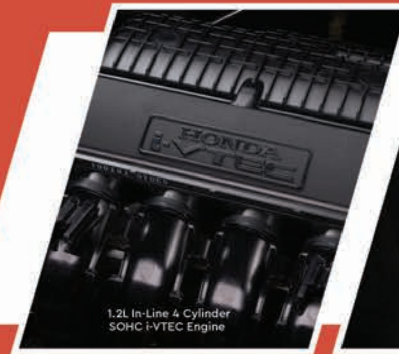
1.2L In-Line 4 Cylinder SOHC i-VTEC Engine