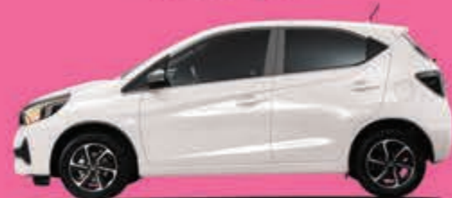
Taffeta White (1.2 V CVT, 1.2 S MT)