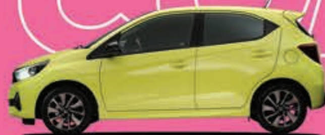
Electric Lime Metallic (1.2 RS Black Top CVT, 1.2 V CVT)