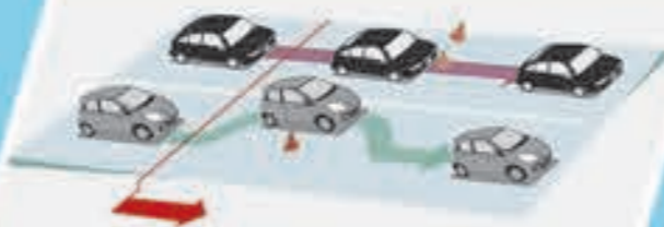
Anti-Lock Braking System (ABS)