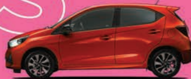
Phoenix Orange Pearl (1.2 RS Black Top CVT)