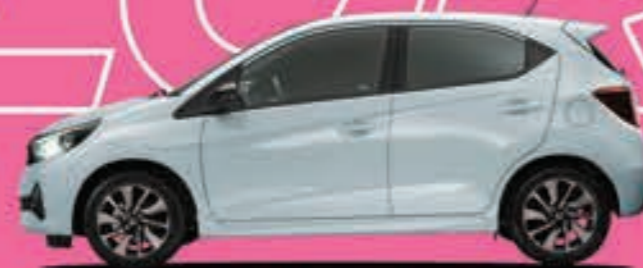
Stellar Diamond Pearl (1.2 RS Variants)