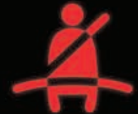
Driver's Seat Seatbelt Reminder

The New Honda Brio's specially constructed frame dissipates G-forces in the event of collision. From automatic safety maneuvers to impact-mitigating measures, these top-notch features bring you peace of mind whenever you drive.