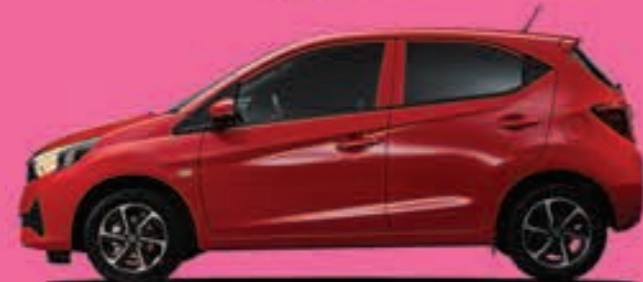
Rallye Red (1.2 V CVT)