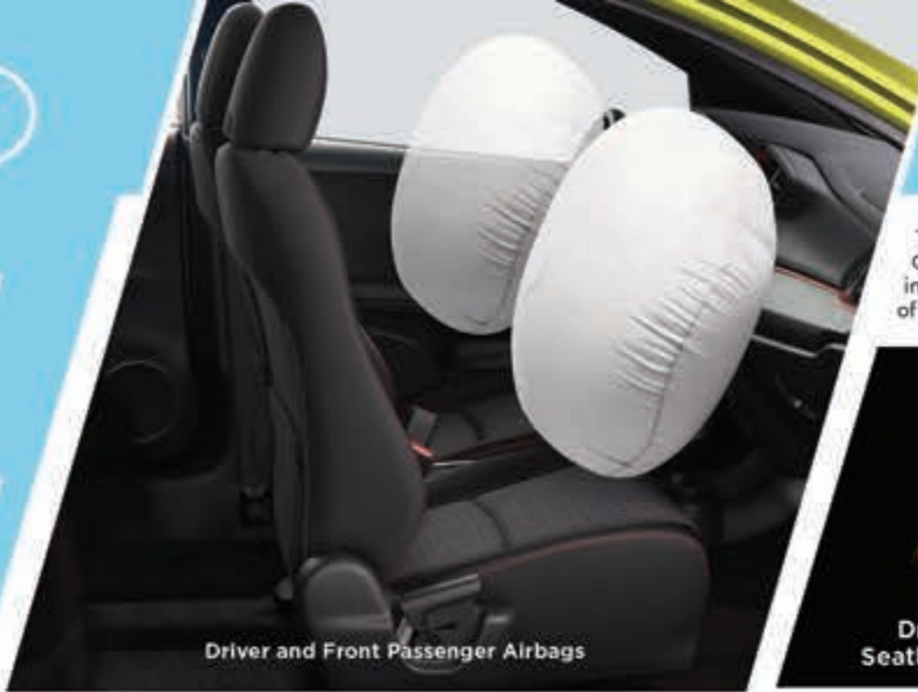
Driver and Front Passenger Airbags

The New Honda Brio's specially constructed frame dissipates G-forces in the event of collision. From automatic safety maneuvers to impact-mitigating measures, these top-notch features bring you peace of mind whenever you drive.