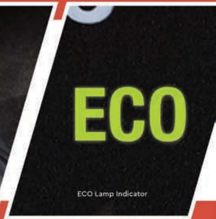
ECO Lamp Indicator

Powerful engine performance and fuel efficiency to take on the road. The 1.2L In-Line 4-Cylinder SOHC i-VTEC engine with a Continuously Variable Transmission (CVT) boasts superior responsiveness and maneuverability. Bring on outstanding fuel efficiency, so you can take the New Brio on long drives with no worries and no compromises.