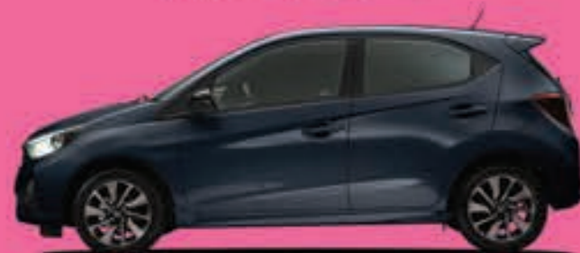
Meteoroid Gray Metallic (1.2 RS Variants, 1.2 V CVT, 1.2 S MT)