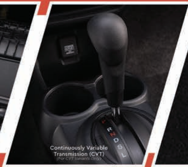
Continuously Variable Transmission (CVT) (For CVT Variants Only)